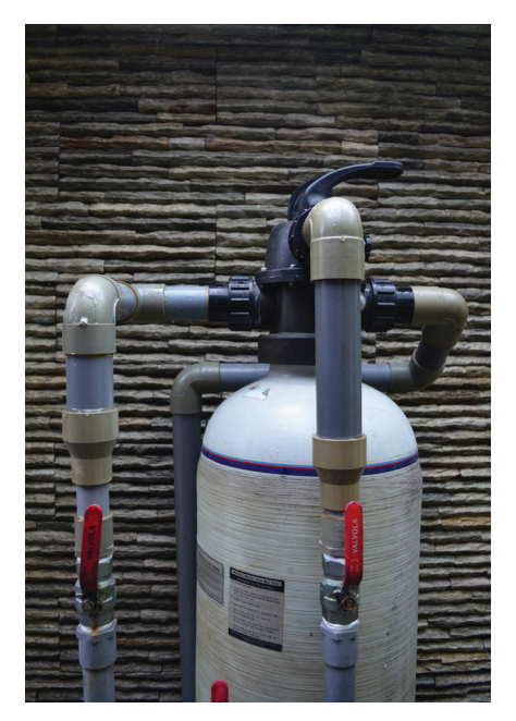
Waterco filters can operate up to 7 bar pressure rating, are hydraulically efficient and can be customised according to customer requirements." Koo explains